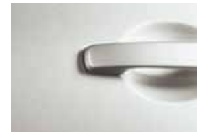
Blade Silver /M KY0