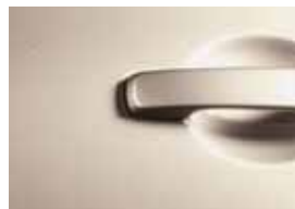
Café Latte /M C30