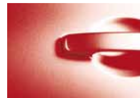
Flame Red /S Z10