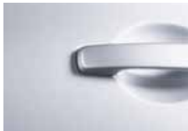
NEW Mineral Grey /M KAQ