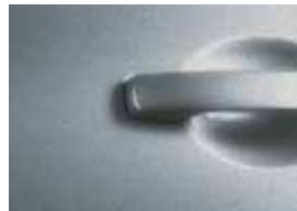
Faded Denim /M B52