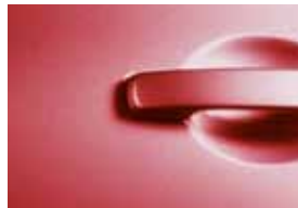
NEW Magnetic Red /M NAJ