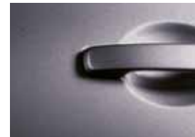
Nightshade /M GAB