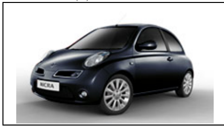
Nero Black (M)