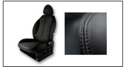
Graphite Part Leather