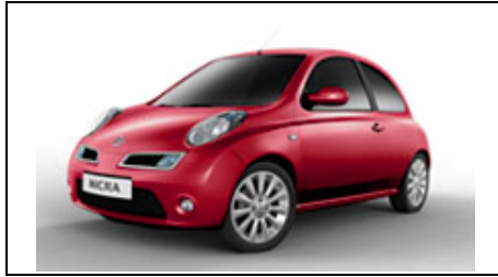
Flame Red (S)