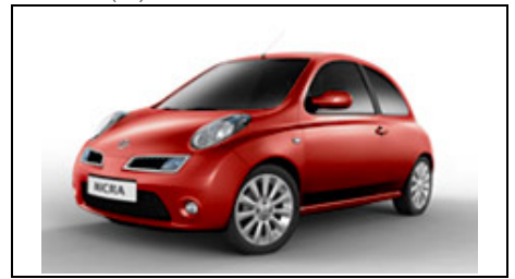
Emotion Red (M)