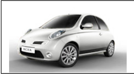
Arctic White (S)