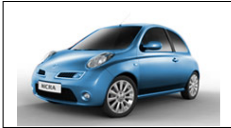
Pacific Blue (M)