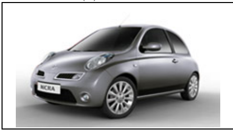
Techno Grey (M)