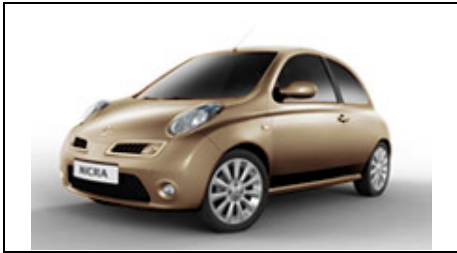
Caffé Latte (M)