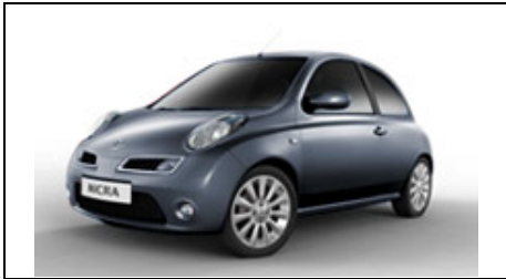
Faded Denim (M)