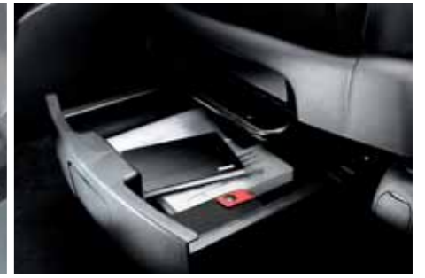
Tray under the front passenger seat