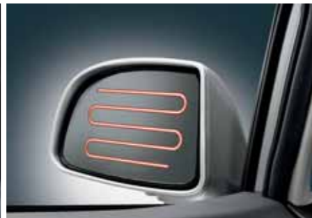
The outside mirrors are electrically adjustable on all models and heated (on higher grades), while an electrically folding function (high grade) leaves more manoeuvring space in narrow streets or parking spaces.