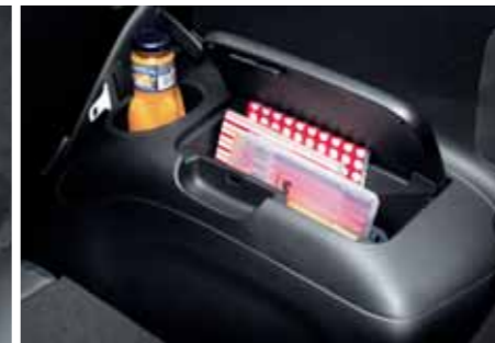
3rd Row storage boxes (7-seat)