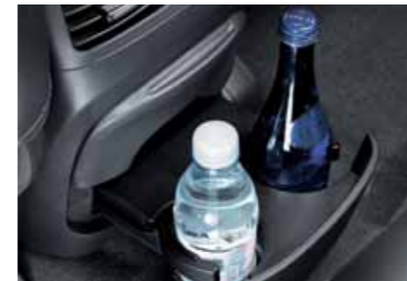
2nd Row dual cup holders