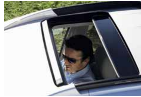
Enjoy the sunny days with the power tilt and slide sunroof (high grade)