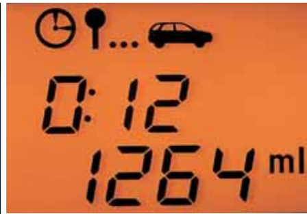
The trip computer (high grade) is located in the cluster, providing up-to-date information about the distance travelled, time travelled, average fuel consumption, km / mile conversion and the outside temperature.