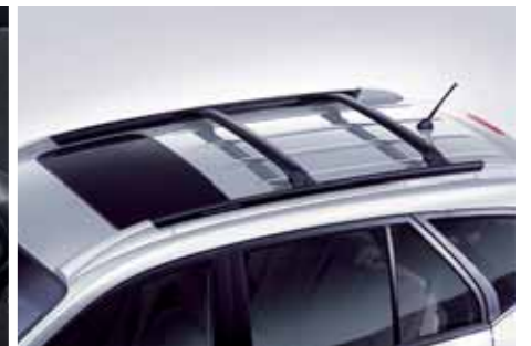
Roof rails (on higher grades)