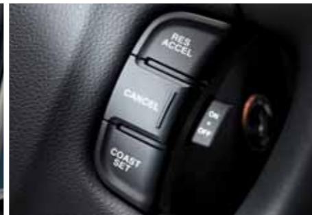
The auto cruise control (high grade) is a welcome convenience on long drives.