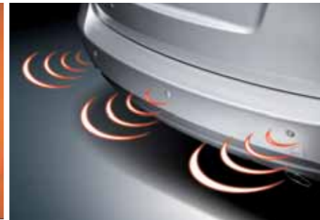
The rear parking sensors (optional, standard on high grade) provide more peace of mind when parking in narrow spaces.