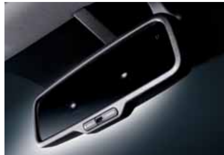
An electro-chromic mirror automatically dims reflected light to provide welcome eye-relief during night driving (on high grade).