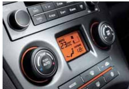
Climate control (high grade)