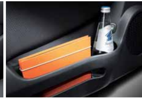
Front door pockets