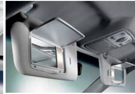
Sun visors and vanity mirrors